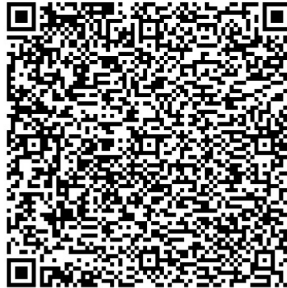
Woodpecker West - ORANGE